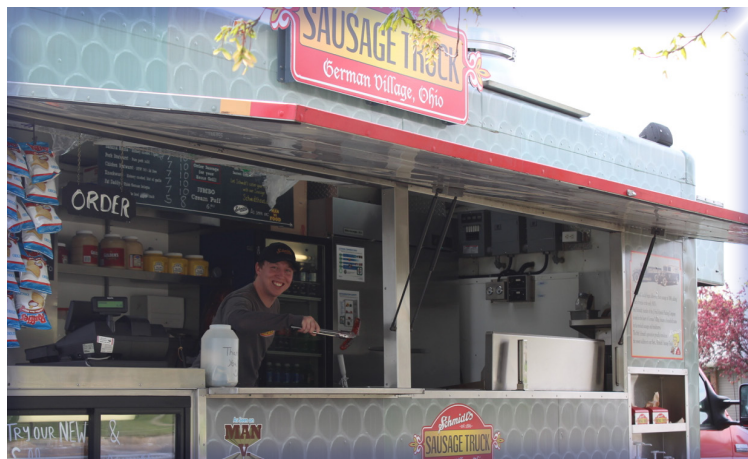
Schmidt's Food Truck will be at Spring Environmental Day serving lunch and refreshments.

For more information, go to www.jacksontwp.org .